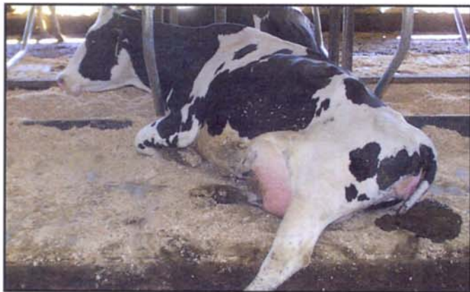
Figure 7. Cows that use side-lunge stalls tend to lie on a diagonal and defecate on the outer corners of the stalls.

Another variation of a side-lunge divider is the “Michigan” divider, designed to allow a cow to lunge below the lower rail. For adult Holstein cows, there should be 32 inches (81 cm) of clearance below the lower bar where the lunge occurs. 2 Brisket boards are not usually recommended with this particular divider as they may intrude into the lunge space. In our experience, it is common to find these dividers hung too low, as in Fig-