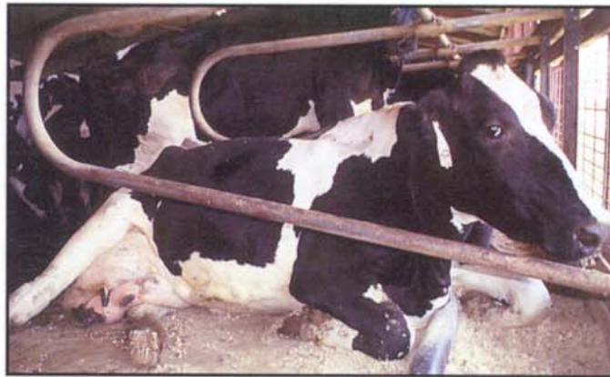
Figure 8. This cow is becoming entrapped in a 7.5 foot (2.3 m) stall after unsuccessfully trying to lunge over a rail that measured 18 inches (46 cm) above the bed near the brisket board.

While there is a general awareness of the need for lunge room, we frequently find that the “bob-zone” is compromised. The bob-zone is the portion of the lunge space from a few inches above the stall bed to about 30 inches (76 cm) high. Sometimes this space is filled with reserves of bedding. Another infringement of the bob-zone sometimes occurs with a construction technique of mounting the stall dividers on transverse horizontal pipes, as shown