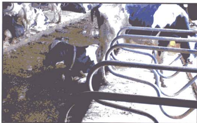
Figure 10. Poor stall usage where Michigan dividers allow only 24 inches (61 cm) of height in the lunge space below the lower rail. The neck rails are also low at 38 inches (97 cm) above the platform.

in Figure 11. If the total stall length does not allow for a full forward lunge behind the pipe, the bob-zone will be compromised and result in reduced stall usage. The dividers should be mounted on vertical posts to avoid forward obstructions in this zone.