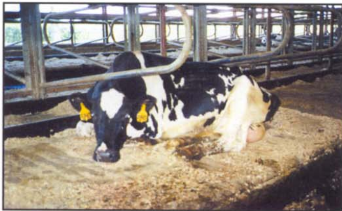
Figure 9. This cow is entrapped after trying to lunge below a lower divider rail that measures 18-20 inches (46-51 cm) above the mattress. The head-to-head stall dividers are mounted on a horizontal rail that intrudes into the bob-zone at 11 inches (28 cm) above the stall bed.