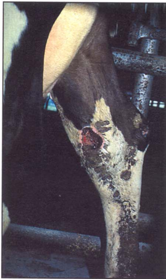
Figure 6. Medial hock ulceration related to pressure sores from leg lying across the rear curb in dug-out stalls.

If any impediment prevents the forward lunge and bob, the cow must lift more weight with her rear legs. If the foot slips, this will contribute to bedding loss from the stall and possible injury to the cow.