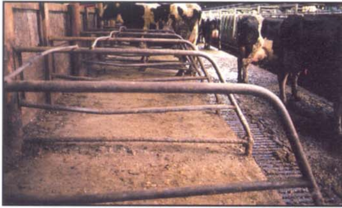
Figure 3. This freestall was common in dairy barns constructed in the 1970s and 80s. The bare concrete surface is unacceptable, the 7-foot (2-meter) platform does not allow forward lunge, the middle rail at 20 inches (51 cm) above the stall surface prevents side lunge, and the neck rail at 36 inches (91 cm) is too low. Notice that the cows have bent both the middle divider and neck rails.

or solid rubber mats without bedding are unacceptable surfaces for the humane housing of cows.