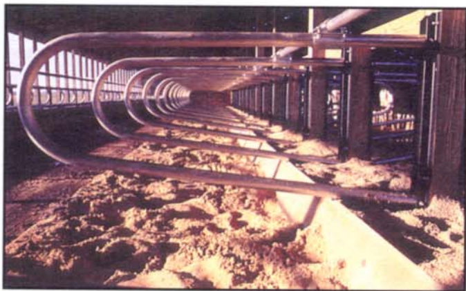
Figure 5. Failure to maintain sand has resulted in a fully exposed 2" x 12" (5 x 30 cm) brisket board, resulting in impediments to the "lunge and bob motion" and to the forward extension of the front legs.

no new cases were seen, and the individual cow hock problems resolved over the next 6 weeks.