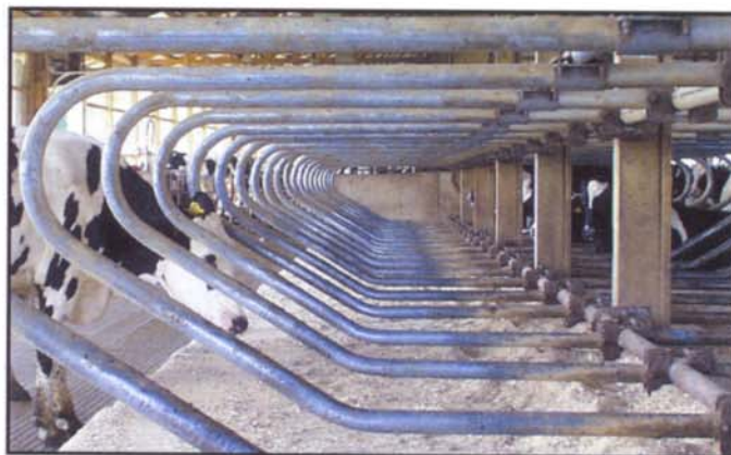
Figure 11. These dividers are mounted on a horizontal rail that intrudes into the bob-zone in these 7.5 ft (2.3 m) stalls. The lower rail of the divider reaches 10 inches (25 cm) above the mattress, which allows side lunging.

Recommendations for height of the neck rail vary considerably. Traditional recommendations have located the neckrail at a height 6-10 inches (15-25 cm) below that of the withers. For example, in a Holstein herd where first-lactation cow wither height may average 54 inches (137 cm) and older cows average 56 inches (142 cm), the neck rail might be positioned 46 to 48 inches