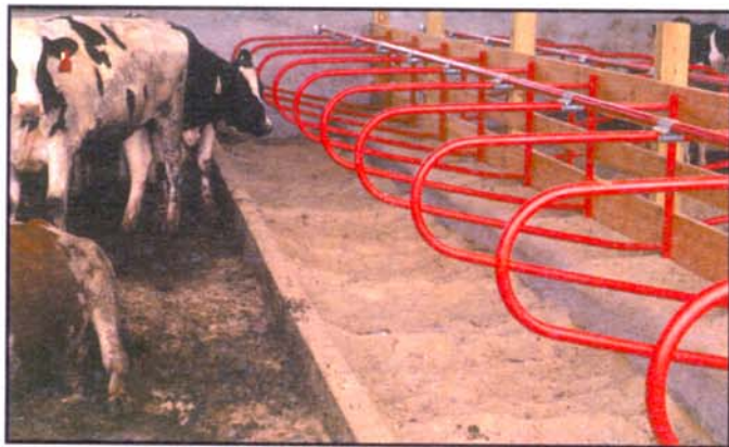
Figure 4. Failure to replace sand has caused the rear curb to protrude and shorten the effective resting body space, resulting in the heifers refusing to use the stalls.

Protruding rear curbs are a risk factor for medial hock ulcers of cattle. While the length of the bed may not be adequate for the cow to lie parallel to the divider, there may be adequate length on a diagonal between the brisket board and protruding curb. From the diagonal position, the upper rear leg will extend across the protruding curb out into the alley, and the full weight of the leg will rest on the bony prominence of the medial hock on the concrete curb. In a dramatic case in a herd of 900 milking cows, approximately 150 cows had developed medial hock ulcerations, as shown in Figure 6, and three cows had died of resulting infections. The sand-stall bedding crew had neglected the stalls during spring cropping activities and the problem developed during late spring. Upon diagnosis, the stalls were filled,