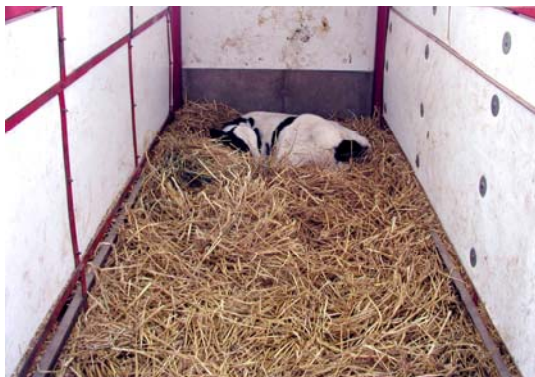
Figure 4. An example of “nesting” score 3 because the legs of this calf are completely submerged in loose bedding and not visible.

Bedding provides a potentially effective mechanism for calves to reduce heat loss. If the bedding is sufficiently deep, the calf can “nest” and trap a boundary layer of warm air around itself, which reduces the lower critical temperature of the calf (Webster, 1984). While several aspects of bedding were evaluated, including type and dry matter, the factor that emerged as having a significant association with the prevalence of calves with respiratory disease was “nesting” score. Nesting score 1 was assigned when the calf appeared to lie on top of the bedding with legs exposed. Score 2 was assigned where calves would nestle slightly into the bedding, but part of the legs were visible above the bedding. Score 3 was used when the calf appeared to nestle deeply into the bedding material and legs were not visible as shown in Figure 4. Because all of the calves were not observed while lying down, a nesting score was assigned to each barn based on the most frequently observed score.