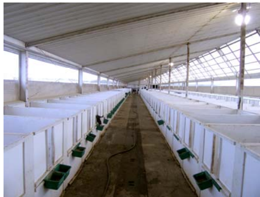
Figure 1. Interior view of a naturally ventilated calf barn with four rows of pens. There is a ridge opening above the translucent-panel roof to the south, adjustable curtain sidewalls, and individual calf pens surrounded by solid panels and a feeding opening in the front.