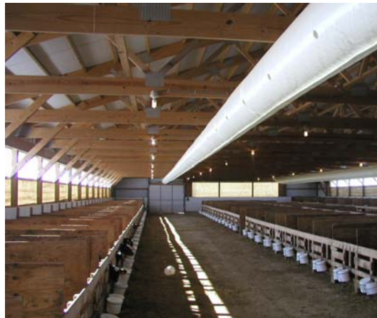
Figure 5. Interior of a naturally ventilated calf barn with 4-rows of individual calf stalls. Two positive-pressure air distribution duct systems have been installed to deliver small volumes of fresh, outside air to each pen within the barn.

Because total airborne bacterial counts are associated with the prevalence of respiratory disease in young calves, a number of techniques have been tried in our clinical services in problem barns. The most successful intervention has been the installation of supplemental positive-pressure ventilation systems as shown in Figure 5. Fresh, outside air is forced into a positive pressure duct system and directed downward into the pen microenvironment. Compared to metal ductwork, we have usually recommended fabric or polyethylene vent tubing because of cost savings.