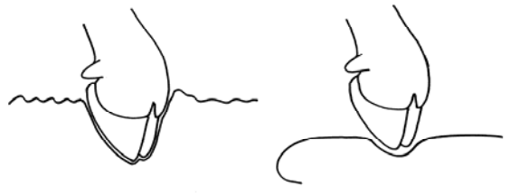
Figure 3. Compare how the toe of the main weight bearing limb of the cow interacts with the stall surface during rising and lying movements. The cushion and traction of sand (left) is in stark contrast to the small surface area of contact on a mat or mattress stall (right).

We believe these poor environments in which lame cows struggle to gain appropriate periods of rest result in a failure to cure and extended periods of lameness – effectively making sure that if a cow becomes lame, she ‘stays lame’.