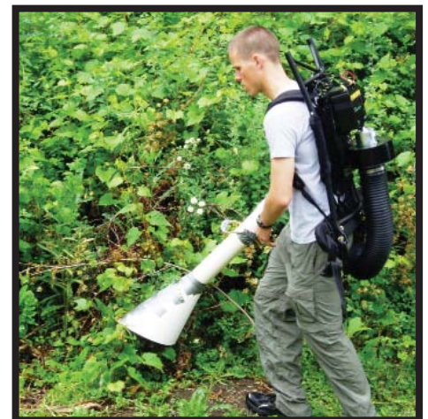
The author uses a backpack aspirator to collect blood fed mosquitoes in suburban Chicago, Ill.

Learning more about host choice will improve our understanding of which mosquito species are transmitting the pathogen among birds