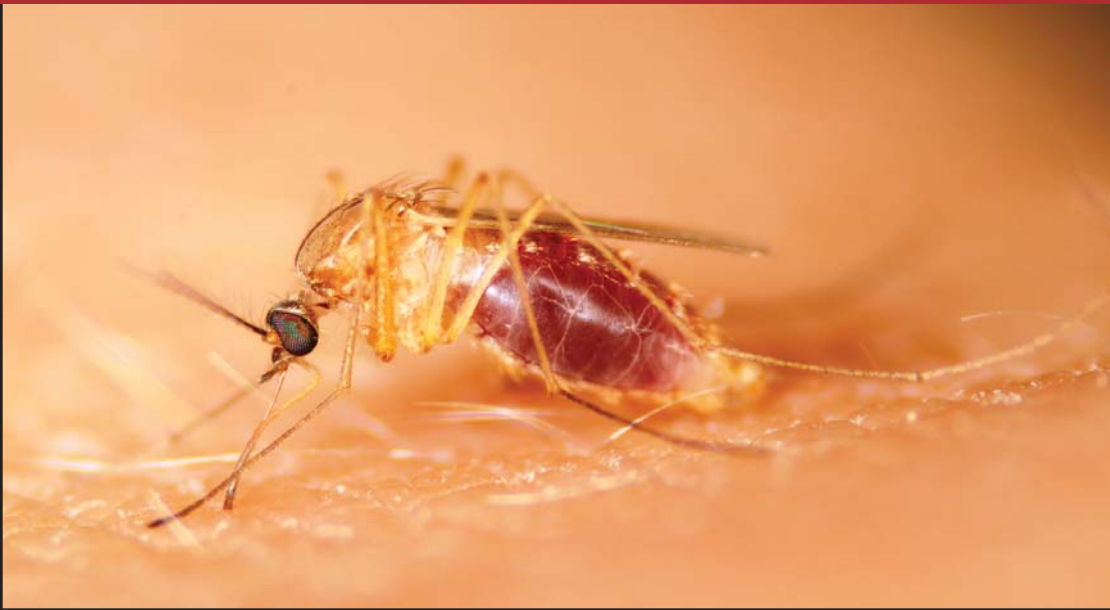
A Culex pipiens mosquito collects a blood meal from the photographer's hand. This insect is one of the culprits involved in the transmission cycle of West Nile Virus. See page 16 for the full story.

Fisheries & Wildlife SPOTLIGHT is printed on recycled paper.