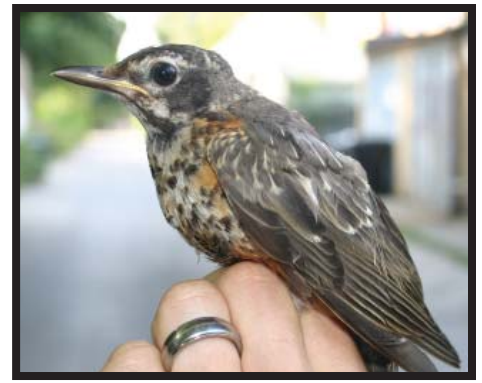
The author holds a juvenile American robin captured while mist-netting in suburban Chicago, Ill.

Our research team collected blood-fed mosquitoes from 2005 to 2007 in residential and semi-nat-